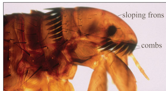
FIGURE 1. Characteristic pronotal and genal combs in a cat flea ( Ctenocephalides felis ).

Effective management of flea bites requires avoidance of infested areas and eradication of fleas from the home and pets. Home treatment should be performed by a qualified specialist and a veterinarian should treat the pet, but the dermatologist must be knowledgeable about treatment options. Flea pupae can lie dormant between floorboards for extended periods of time and hatch rapidly when new tenants enter a house or apartment. Insecticidal dusts and spray formulations frequently are used to treat infested homes. It also is important to reduce flea egg numbers by vacuuming carpets and areas where pets sleep. 3 Rodents often introduce fleas to households and pets, so eliminating them from the area may play an important role in flea control. Consulting with a veterinarian is important, as treatment directed at pets is critical to control flea populations. Oral agents, including fluralaner, afoxolaner, sarolaner, and spinosad, can reduce flea populations on animals by as much as 99.3% after 7 days. 4,5 Fast-acting pulicidal agents, such as the combination of dinotefuran and fipronil, demonstrate curative activity as soon as